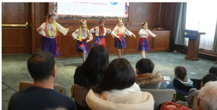
DC Music Academy's SLAVA School of Ukrainian Music and Dance Children's Ensemble performance for Family Day at the VOC Museum.