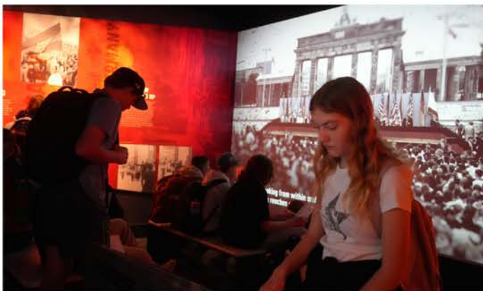
Students from American Academy in Colorado tour the Victims of Communism Museum.

VOC is currently holding a student essay contest to teach young people about how the Declaration of Independence inspired freedom movements around the world. VOC will recognize up to 52 outstanding student essays (U.S. high school and college students are eligible) that focus attention on how the Declaration influenced declarations, speeches, and other political writing in foreign contexts during the 20th century. For more details and to apply, visit victimssofcommunism.org .