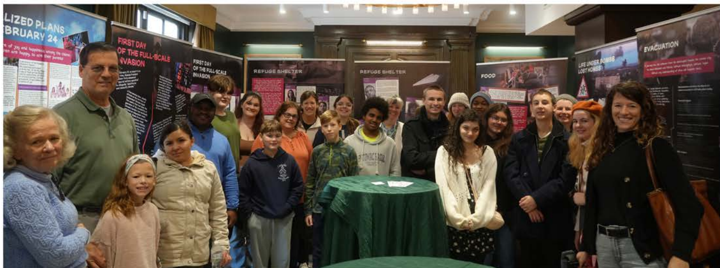
Homeschool group from Bowie, Maryland.