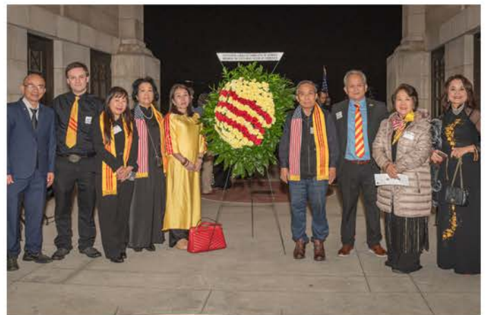
Members of the Vietnamese American Community of Georgia and Vietnamese Women’s Association of Georgia.