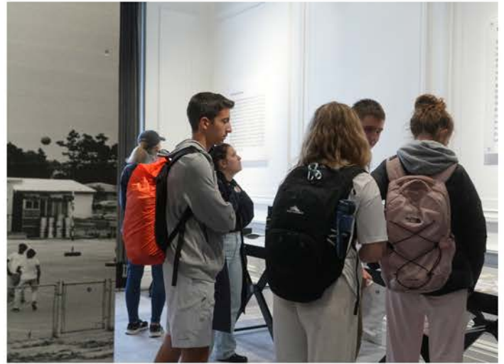
VOC has taught hundreds of students about Operation Pedro Pan through our current temporary museum exhibit.

VOC works to ensure that the rising generation understands the truth about communism and the eternal value of freedom. Since 2016, our curriculum has been equipping middle and high school teachers to tell students the truth about communism. Just last year, we published the fourth edition of our flagship high school curriculum and expanded our curricular materials to middle schools and even elementary grades. We now offer five different curricula for students ages 4 th grade through university level.