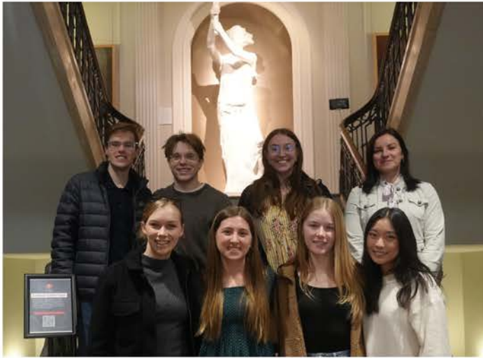
Students from Hillsdale College tour the Victims of Communism Museum.