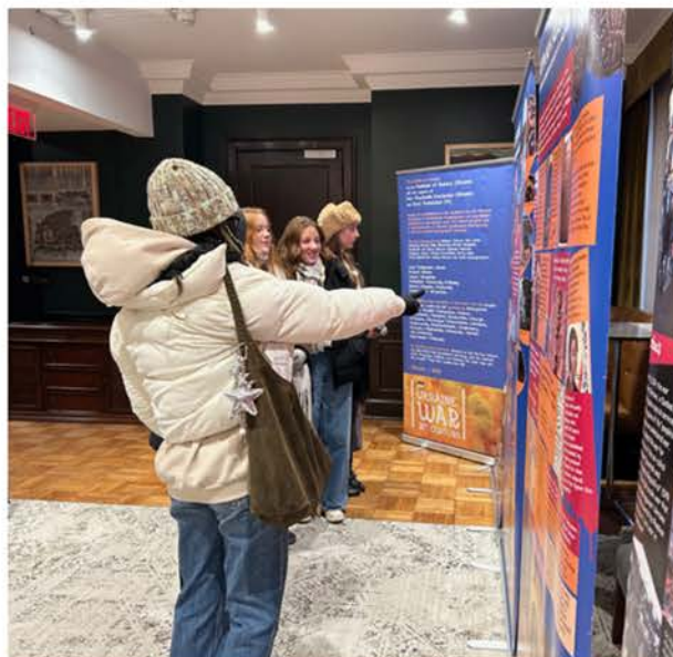
High school seniors visiting from Norfolk, Virginia.