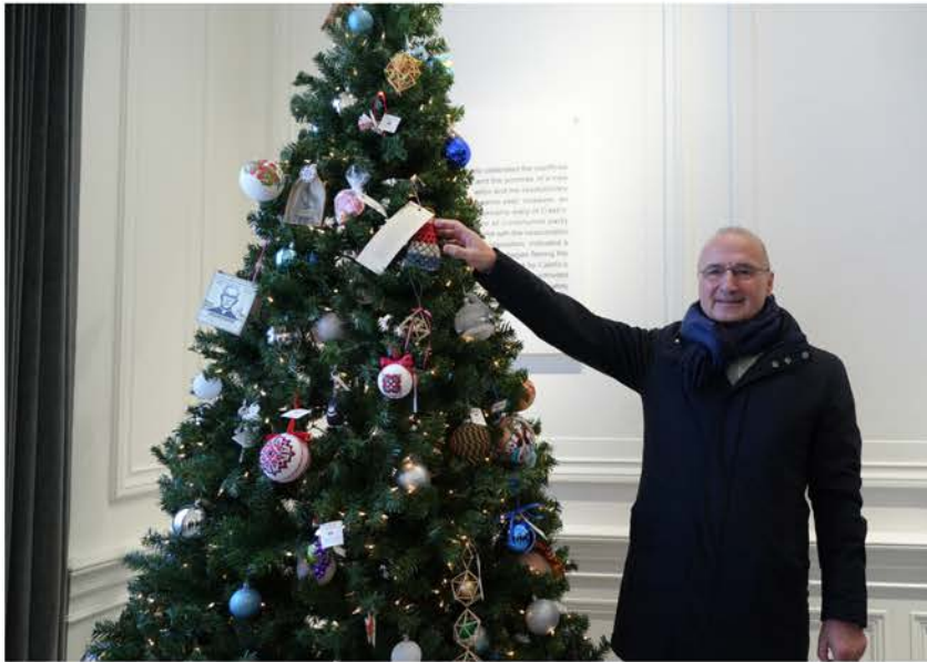
Croatian Minister of Foreign and European Affairs, Gordan Grlić Radman, places the Croatian Embassy ornament.

VOC is honored to have 14 embassies and partner organizations participate in contributing an ornament for the annual Captive Nations Christmas Tree.