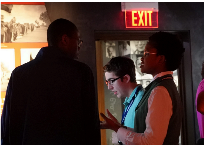
Students from the Florida Debate Initiative tour VOC’s museum galleries.

—Student from The Fund for American Studies summer internship program