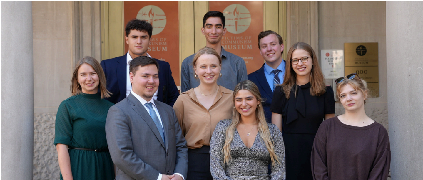
VOC's 2024 Summer Intern Cohort

This summer, VOC welcomed nine new interns from across the globe, including Florida International University, Gonzaga University, Tallinn University, University of Iowa, University of North Carolina, University of St Andrews, University of Texas, and University of Virginia. They have participated in professional development trainings, participated in events on Capitol Hill, and have learned more about the history and deadly legacy of communism through guided readings and seminars. Our interns have helped with our signature summer events and have had the opportunity to experience the daily operations of the Victims of Communism Museum.