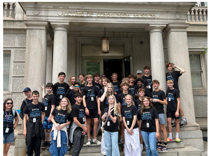
Students from St. Paul’s Lutheran School in front of the VOC Museum.

Teachers report an increase in student knowledge following school tours, with many students reflecting on what they learned at our museum long afterwards. We challenge students to learn world history and think critically in order to avoid the pitfalls of communism, socialism, and neo-Marxist ideas. VOC’s goal is to ensure that the students of today—our children, grandchildren, and neighbors—become the strong anti-communist, pro-freedom leaders of tomorrow.