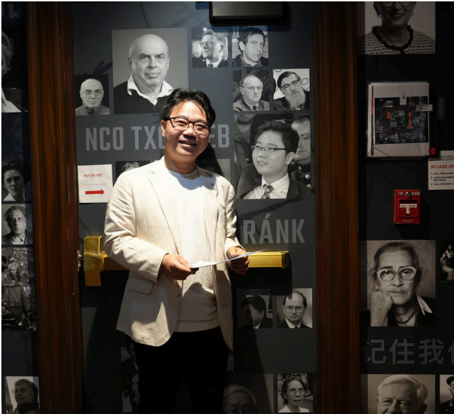
Ji Seong-ho stands in front of his own photo displayed on the VOC Museum's "Remember Us Wall."