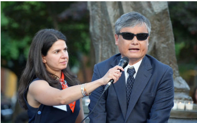
Chinese civil rights activist and 2015 recipient of VOC's Truman-Reagan Medal of Freedom Chen Guangcheng speaks at the vigil.

On June 4, 1989, the Chinese Communist Party (CCP) crushed a massive pro-democracy movement by sending tanks into Tiananmen Square. Beijing has since erased all mention of June 4 from its history. We still do not know the death toll. VOC honored the individuals who stood for freedom at our annual Tiananmen Square Massacre Candlelight Vigil . The Chinese regime continues to suppress democratic thought and freedom of expression, but we will never forget the CCP's victims. The commemoration featured Chinese dissidents and leaders of the Hong Kong, Uyghur, and Tibetan communities. Speakers discussed the need to continue to educate our communities about the horrors of the CCP, and memorialized those who continued to advocate for democracy even in the face of oppression.