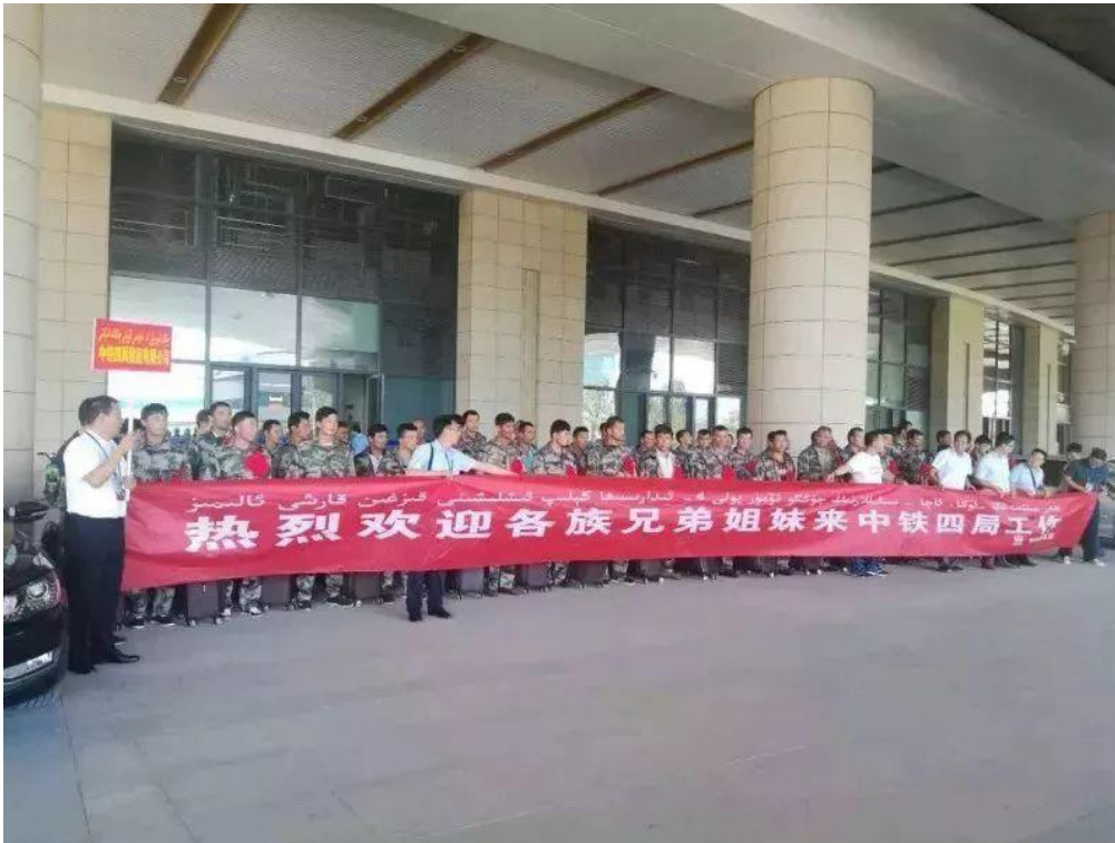
Image of transferred ethnic laborers as part of CREC’s Xinjiang Test Project. Caption text: “上汽大众汽车有限公司与中铁四局一公司新疆试车场项目部联合招收维吾尔等少数民族工人到项目部工作。”

workers). The photo caption states: “The SAIC Volkswagen and CREC 4 th Bureau Xinjiang Test Track Project jointly recruits Uyghur and other ethnic minority workers to work in the project.”