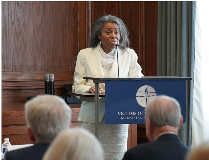
Lt. Gov. Winsome Earle-Sears speaks at VOC's Knights of Liberty Conference.

"The cultural and spiritual resistance were the tools of resistance that communism cannot hope to hold." —George Weigel, Distinguished Senior Fellow, Ethics and Public Policy Center; Author; Lecturer; VOC Academic Council Member