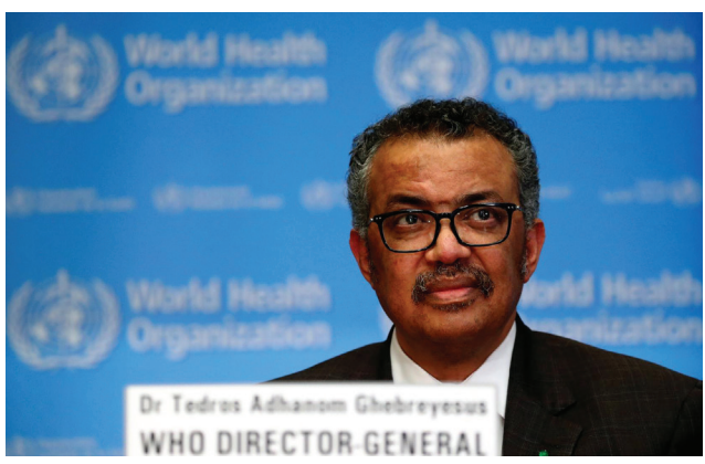
Director General of the World Health Organization (WHO) Tedros Adhanom Ghebreyesus

The CCP has continued to undercount—likely dramatically—the number of cases in Wuhan, even claiming no new cases for multiple days in a row during mid-March. Such claims are challenged by a number of eyewitness Chinese accounts of overburdened funeral homes, extrajudicial killings, and the continued crackdown on the free flow of information. Several factors point to continued PRC misinformation: