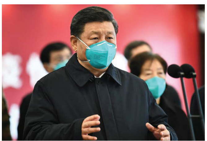
China's President Xi Jinping visits patients and healthcare workers in Wuhan.

The situation demands a strong and principled response. U.S. officials should pursue the following policy objectives: